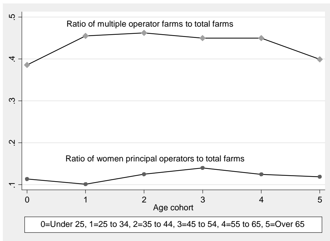
Figure 2. Ratio of Multiple Operated Farms to Total Farms and Ratio of Women Principal Operated Farms to Total Farms

Some expenses listed in the census, such as rent and depreciation, were not directly included as inputs, but rather indirectly included as a charge to the market value of real estate and machinery. Rent expenses only occur if land is rented rather than